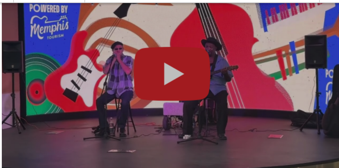
Delta Cats perform at MEM on Monday, November 21, 2022