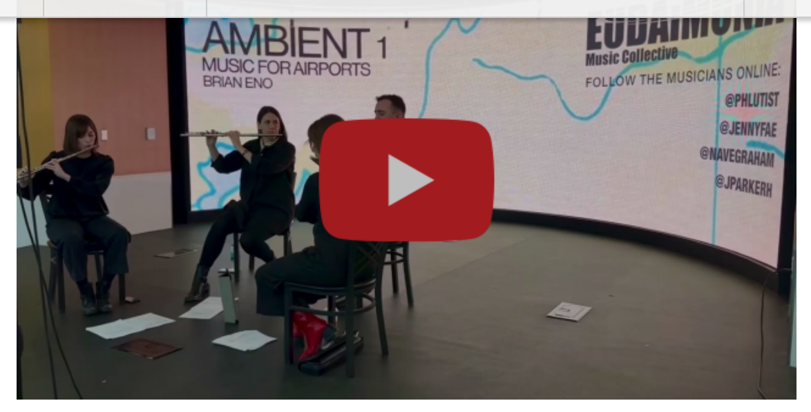
The Eudaimonia Collective performed on Friday, March 17, 2023