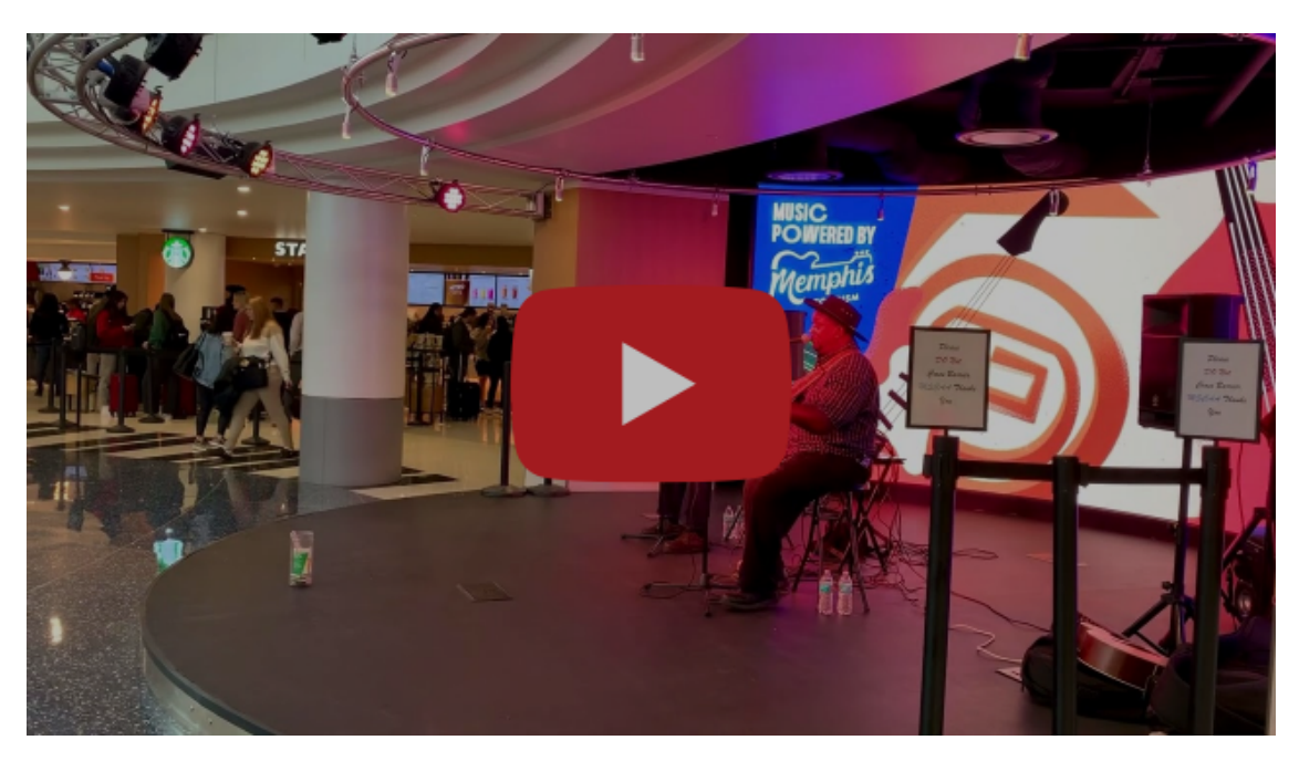
The Delta Cats played MEM on Thursday, March 16, 2023