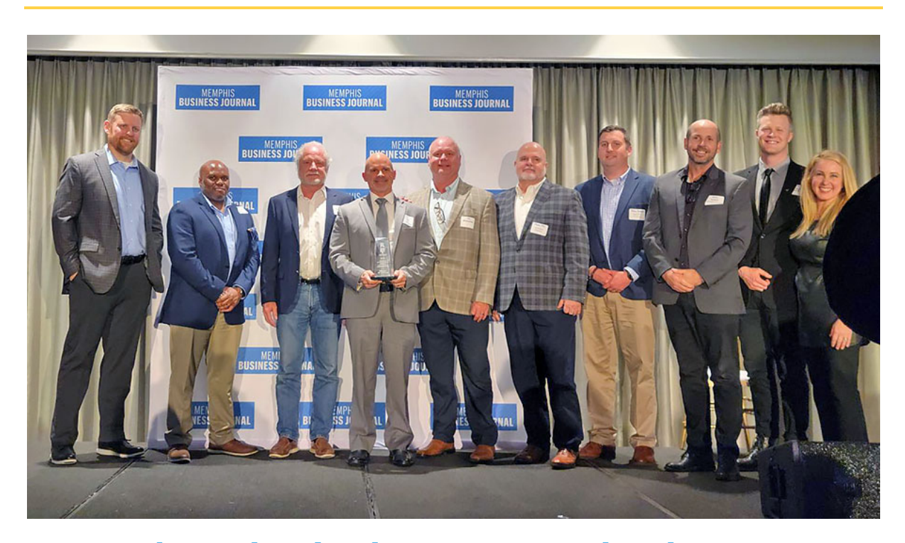
MEM's Modernized Concourse takes home two Building Memphis Awards