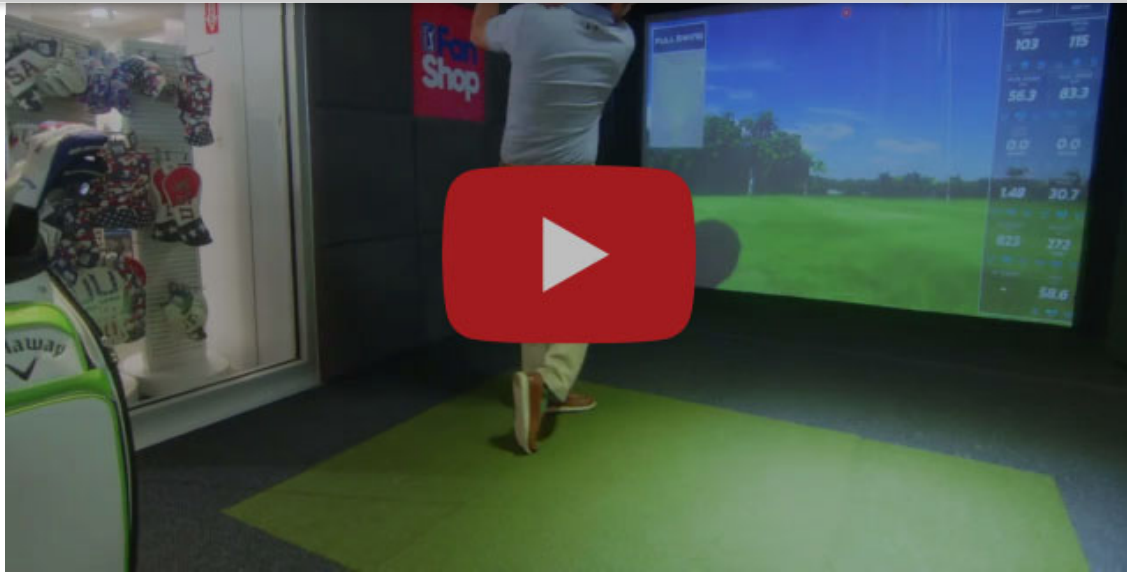
FlightPath 3D promotional spot for WhereWeFly on flymemphis.com