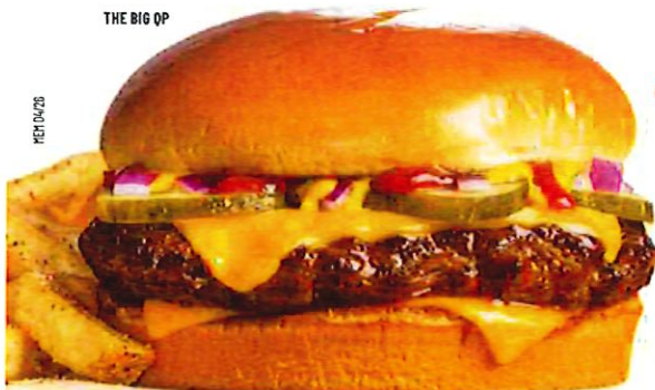
THE BIG QP

(1210-1600 cal) Twelve boneless wings tossed in your choice of up to 2 sauces & served with 2 sides of house-made ranch. Choose from Nashville Hot, BBQ, Buffalo, or Honey-Chipotle sauce. 16.59